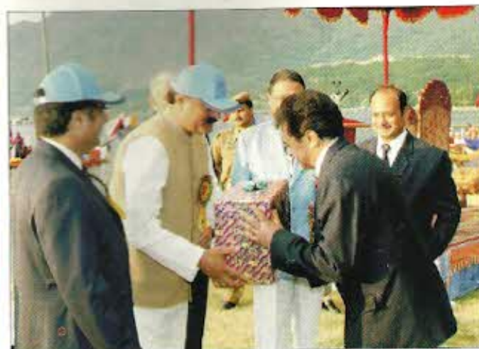
Hon'ble Minister presenting memento to Shri S.Owais IPS IGP Armed J&K & Organizing Secretary of 8th AIPWSC