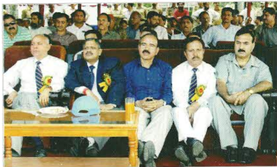
Senior civil and police officers witnessing the inaugural function of 8th AIPWSC