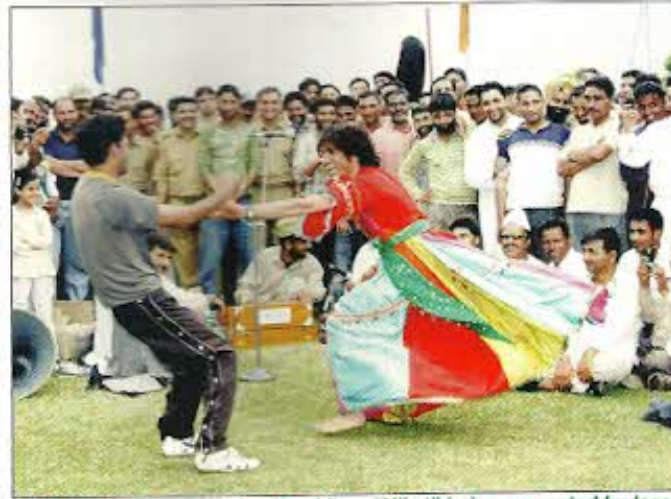
A Kashmiri traditional cultural item "Hikat" being presented by local artists during the closing function of 8th AIPWSC 2009 held at the back lawns of SKICC Srinagar from June 02 to 08, 2009.