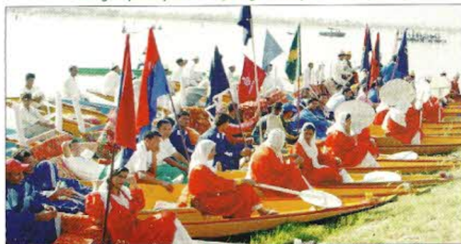
Line up of the participating teams of 8th All India Police Water Sports Championship 2009 on the opening ceremony