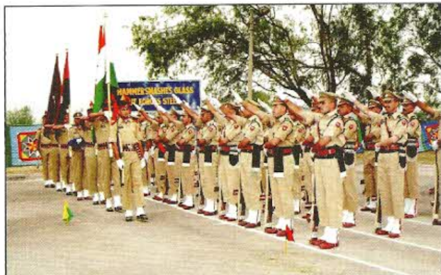
A view of oath taking ceremony of the Probationary DySsP/Inspector/SIs during their Passing out Parade in SKPA Udhampur on June 05, 2009