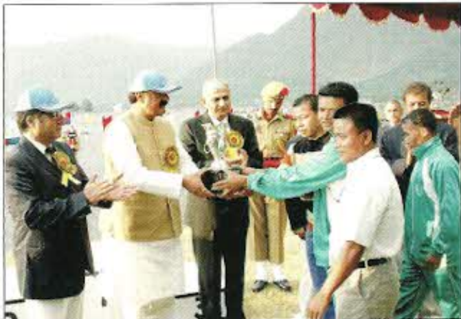
Hon'ble Minister presenting runners up trophy to the Manipur Police team in Canoeing event during closing ceremony of the championship