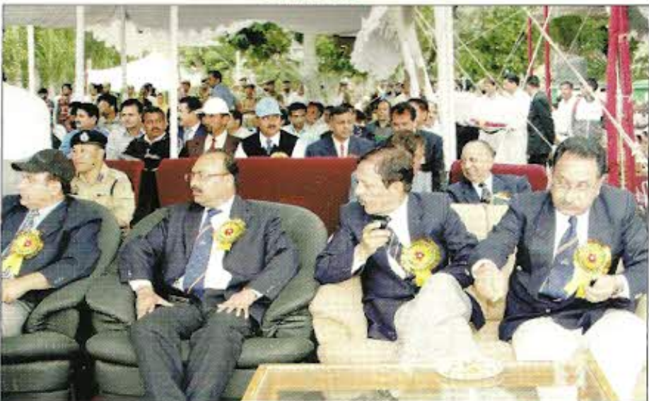
A view of the senior police officers witnessing the valedictory function of the Championship