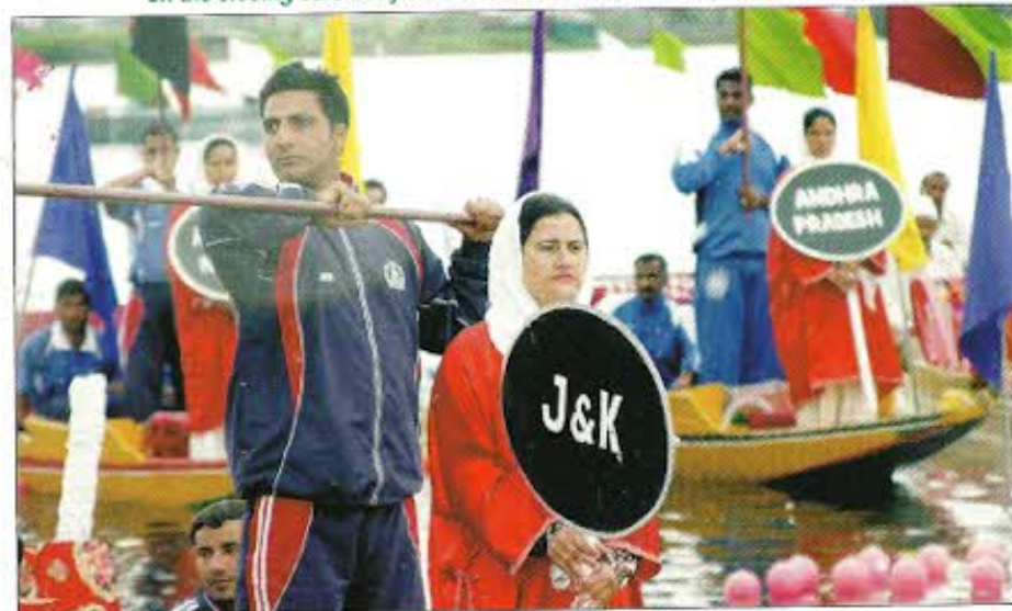
A view of the paddle past by the participating teams on the closing ceremony

Police, BSF, Bihar Police, CRPF, Haryana Police, ITBP, J&K Police, Madhya Pradesh Police, Maharashtra Police, Manipur Police, Orissa Police, Punjab Police, SSB, Tamil Naidu Police, Uttarakhand Police, Uttar Pradesh Police and West Bengal Police. About 350 players participated in these events.