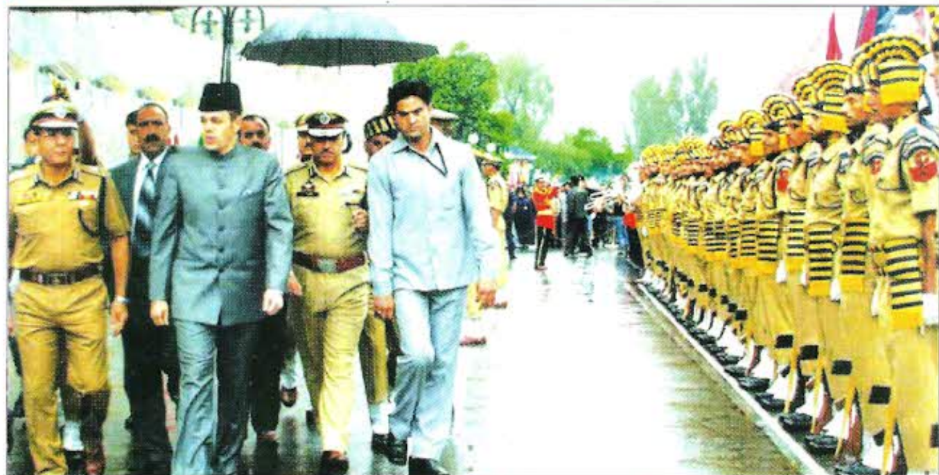
A view of Guard of honour presented to Hon'ble CM J&K Shri Omar Abdullah on the opening of Civil Secretariat at Srinagar on May 04, 2009.

Civil Secretariat, PHQ and other Move offices of J&K State re-opened in Srinagar on May 04, 2009 after closing at Jammu on April 25, 2009 in connection with Bi-annual durbat move.