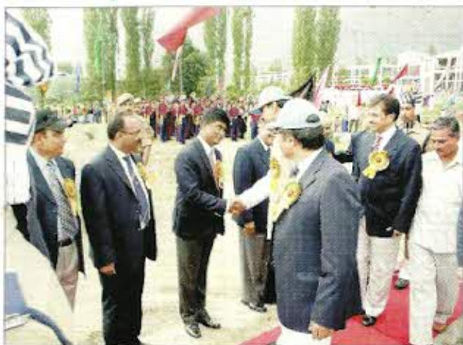
The organizers of the 8th All India Police Water Sports Championship-2009 being introduced to Shri Surjit Singh Slathia Hon'ble Minister for Industries and Commerce J&K by DGP J&K during the concluding function