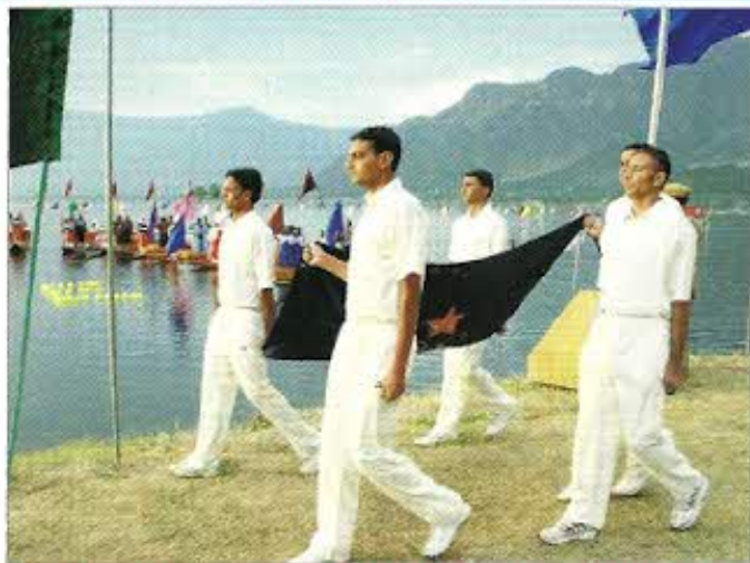
The sports person carrying AIPSCB flag to be handed over to the Chief Guest during the retreat ceremony on the concluding function