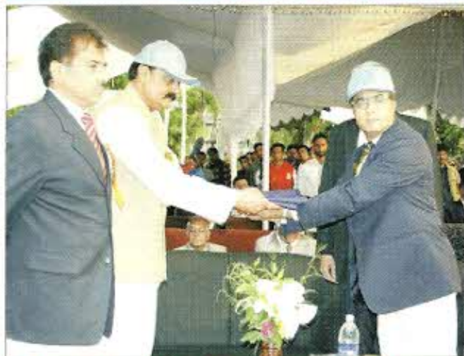
Sh. Surjit Singh Slathia Hon'ble Minister for Industries and Commerce J&K handing over the AIPSCB flag to DGP J&K for safe custody