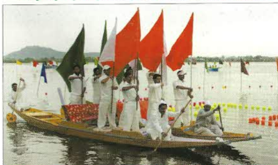
J&K Police personnel displaying the tri-colour in Shikara at world famous Dal lake Srinagar during the paddle past in the opening ceremony of the championship