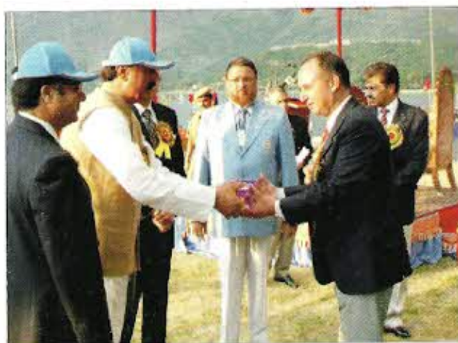
Hon'ble Minister presenting memento to Shri Farooq Ahmad IPS IGP CID J&K on the closing ceremony