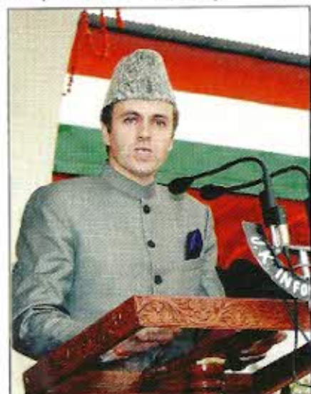
Hon'ble CM J&K while addressing the passing out Parade at SKPA Udhampur

An attestation-cum-passing out parade was held in Sher-i-Kashmir Police Academy Udhampur on June 05, 2009 in which 61 probationary officers comprising of 31 Deputy Superintendents of Police, one Inspector and 29 Sub-Inspectors of Police were administered oath of allegiance after successful completion of their training.