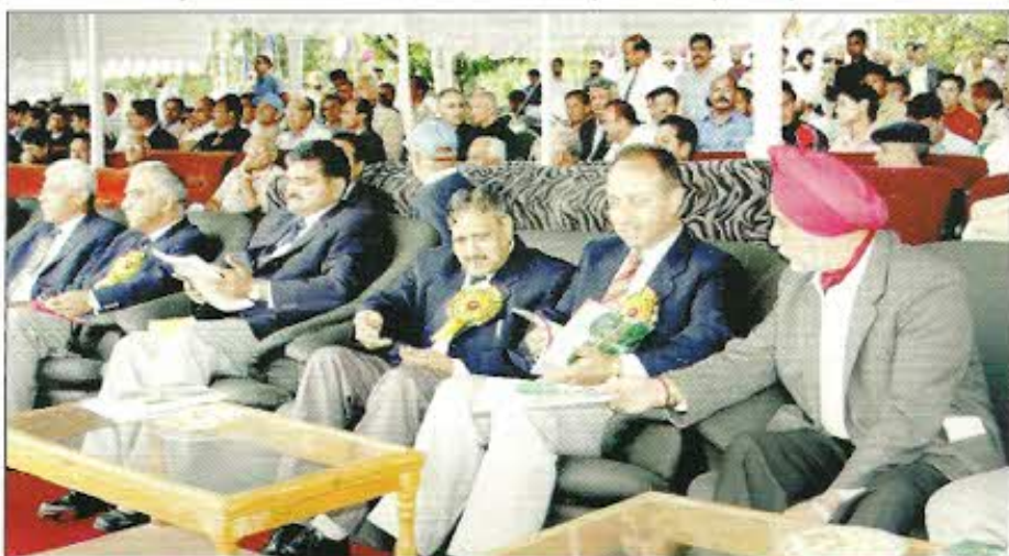
A view of the senior police, CPMF and civil officers witnessing the valedictory function of the Championship