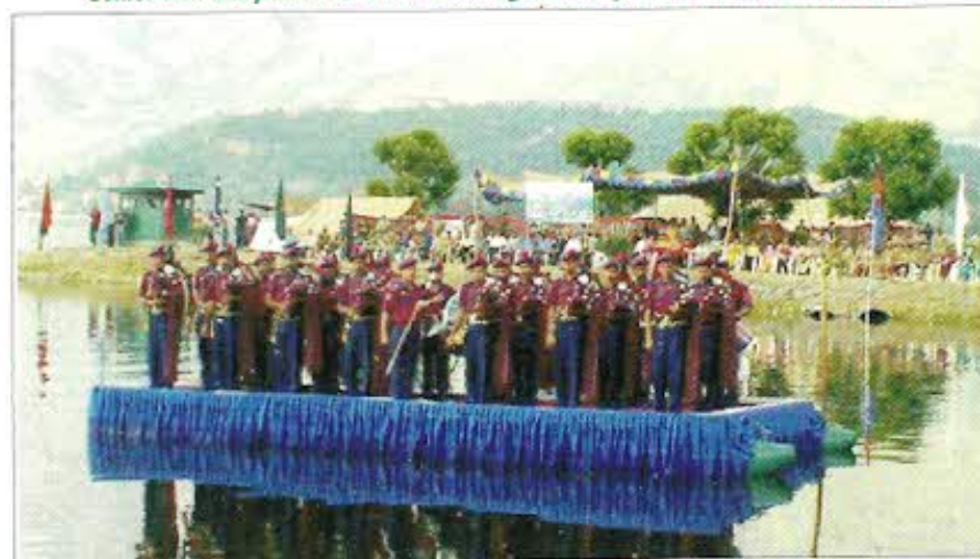
The pipers & Drummers of J&K Police displaying mystifying music during the paddlepast by participating teams on the opening ceremony of 8th AIPWS Championship at Dal Lake Srinagar on June 02, 2009.

lawns of Sher-i-Kashmir International Convention Complex (SKICC) Srinagar on June 02, 2009 declared the championship open and also released a Souvenir on 8 th All India Police Water Sports Championship 2009 on the occasion.