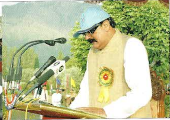
Shri Surjit Singh Slathia Hon'ble Minister of Industries and Commerce J&K addressing the audience on the valedictory function of 8th All India Police Water Sports Championship 2009 on June 08, 2009 at Dal Lake Srinagar