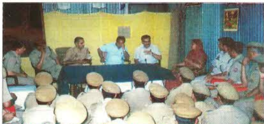
A view of the "Personal Health and Hygiene Awareness" Programme organized at Bn. Hqrs. of IRP 9th Bn. Ramban on June 1st, 2009.