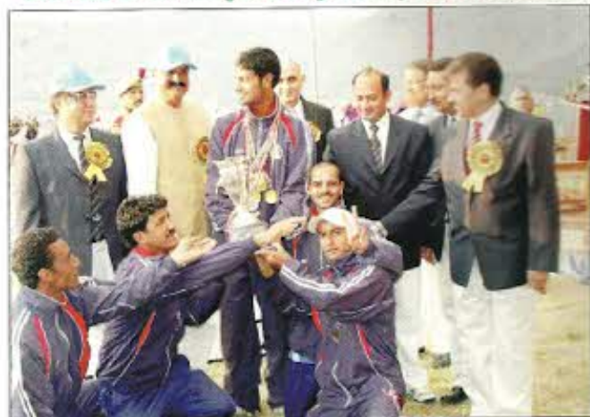
Hon'ble Minister presenting winners trophy to the J&K Police team in Canoeing event during closing ceremony of the championship