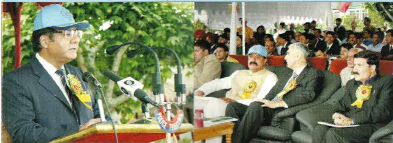
Shri Kuldeep Khoda IPS DGP J&K addressing the audience during the valedictory function of 8th All India Police Water Sports Championship